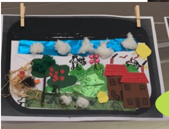
Through the train carriage window