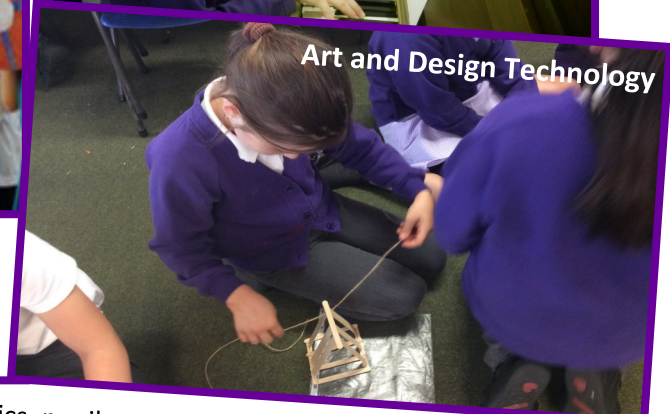
Art and Design Technology

Throughout the year our theme based curriculum is enhanced with educational visits to allow children to have first hand experience of geography and history so that they make links to the wider world.