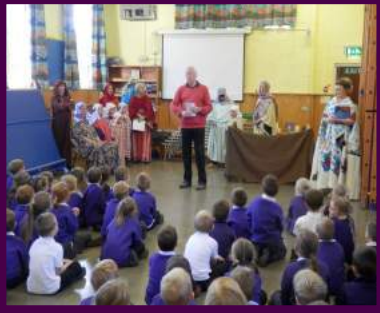
'Open the Book' visiting school.