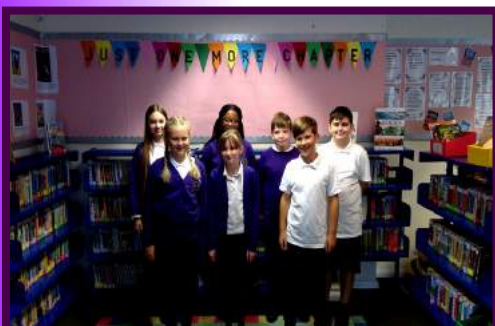
Year 5/6 library monitors at Mill Lane.

Courage - 'A Test of Courage' (Esther 2-9): Esther showed courage when she saw her people being treated unfairly, even though she put herself in danger by speaking out. We encourage our children to show courage to make the right choices and challenge, even when others may not agree.