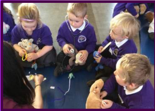
The Teddy Bear Hospital visited Reception.

Our Story - 'The Good Samaritan': The Good Samaritan was a man of compassion, courage and responsibility, who took it upon himself to always do the right thing by others. Even in times of austerity, when it felt scary to do so, he was courageous in the choices he made. He helped more than just his friends, because he believed it was important to value everybody, whoever they were. In the moment, he took responsibility when another was in need, because it was just the right thing to do. He made a difference, not just to one person, but to scores of communities who heard of the humility he showed.