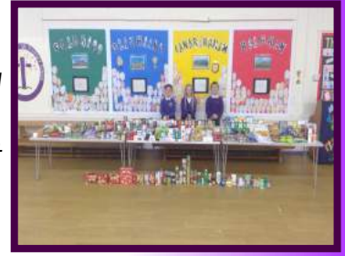
The Food Bank challenge.