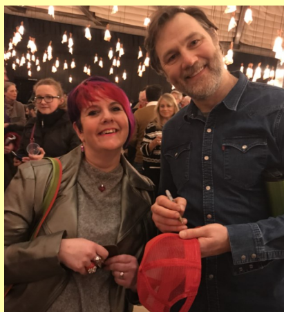
This is my favourite picture of the year—when I met my favourite actor David Morrissey (for the 3rd time...)