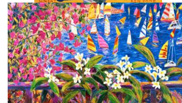
Ken Done's artwork.

Watch this video all about drawing a landscape. Using the picture attached to this document you are going to have a go at drawing Norwich. Look at the key features that stand out.